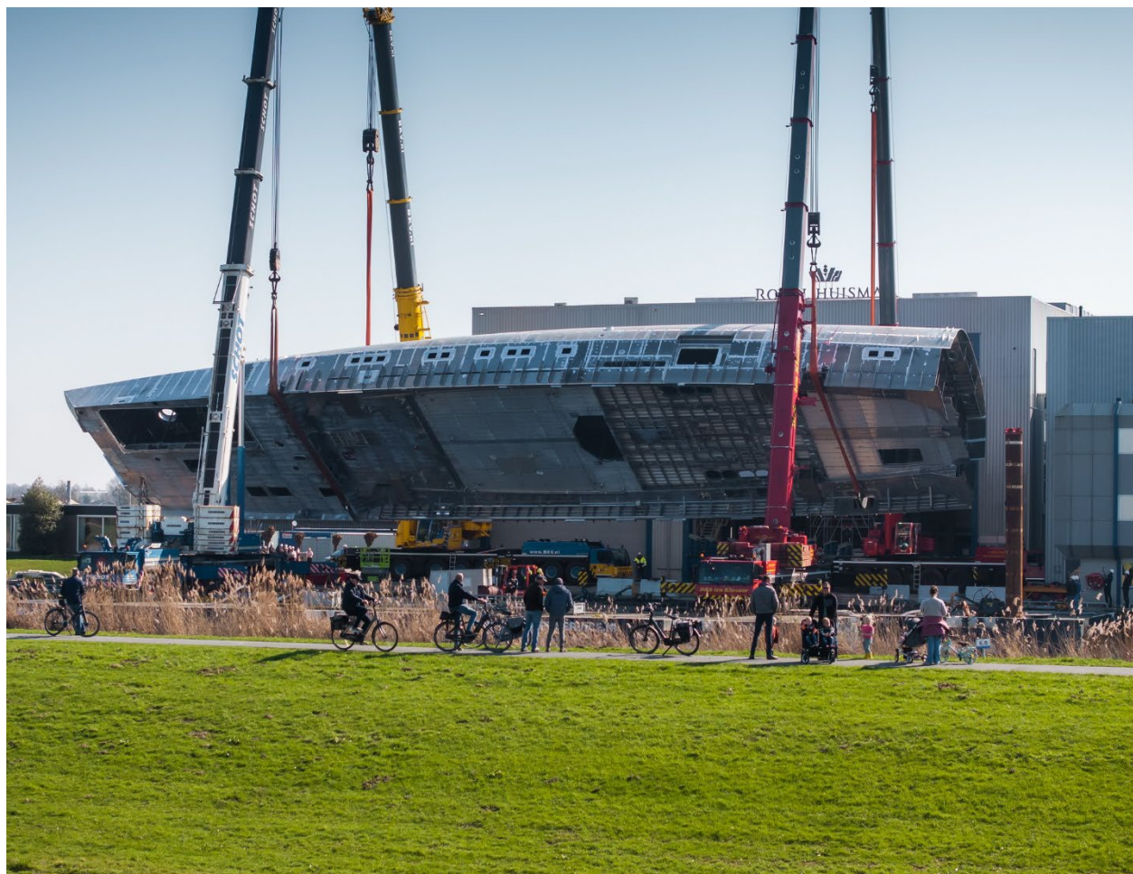
PROJECT 412 DURING HULL TURNING AT ROYAL HUISMAN, VOLLENHOVE