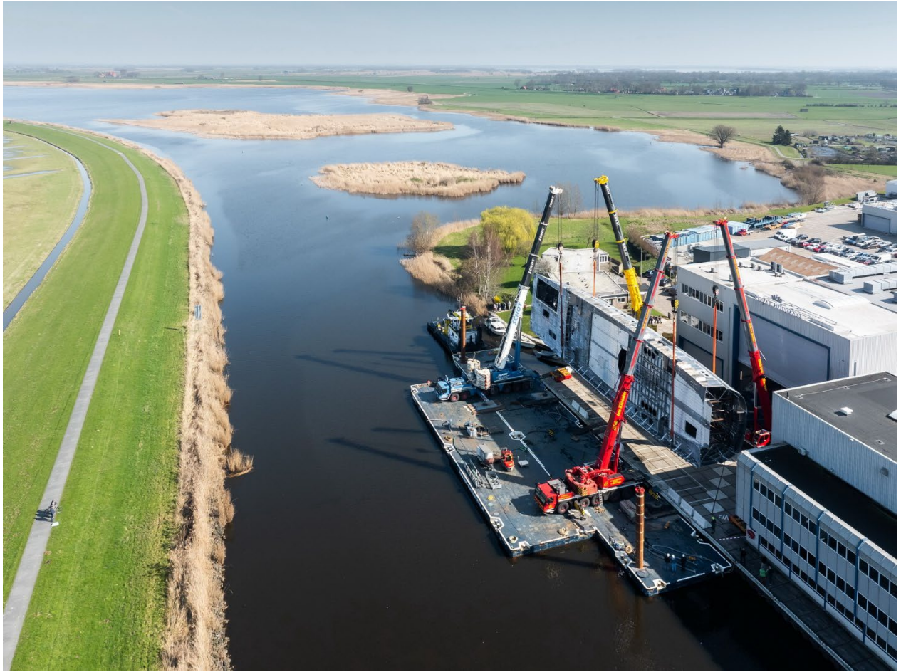
PRECISION LIFTING AND TURNING OPERATION AT THE VOLLENHOVE SHIPYARD