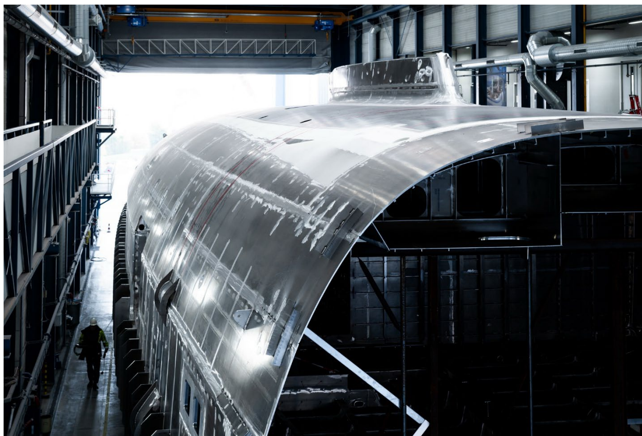
PROJECT 412 IN HALL 1 AT ROYAL HUISMAN, VOLLENHOVE

Project 412 is part of Royal Huisman's successful Trident 810 series. It builds on a proven architectural platform, benefiting from the confidence that comes with an already engineered foundation. Having the original delivered in 2020 and the second one under construction, owners benefit both from a reliable, short project lead time: the opportunity to personalize and realize a fully bespoke superyacht, delivered in just three years.