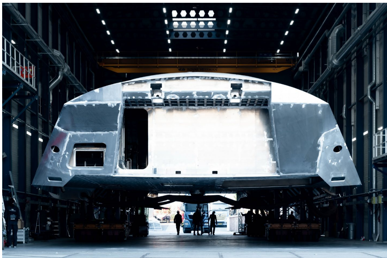
A FIRST GLIMPSE OF PROJECT 412'S SUPER-SIZED SCALE

A hallmark moment in any superyacht build, the hull turning reveals the true scale of Project 412 and marks the transition from primary structure to the next phases of outfitting and systems integration. She will be a super-sized 81m / 266ft sailing yacht. The aluminum hull construction features a distinctive chine from bow to stern. Created for a true sailing experience and world cruising, the contemporary flybridge schooner will be equipped with a state-of-the-art carbon rig supplied by Rondal, combining performance with sail-handling comfort and innovation.